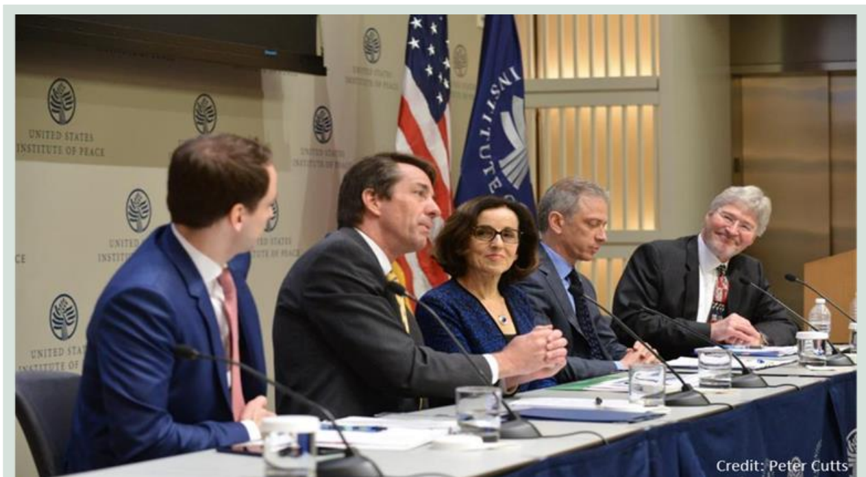
Figure 1. Federal panelists at the Unleashing American Innovation Symposium, held at U.S. Institute of Peace, Washington, D.C. on April 19, 2018.

The ROI Initiative’s vision is to “unleash American innovation” into our economy and its goal is to “maximize the transfer of Federal investments in science and technology into value for America in ways that will (a) meet current and future economic and national security needs in a rapidly shifting technology marketplace and enhance U.S. competitiveness globally, and (b) attract greater private sector investment to create innovative products, processes, and services, as well as new businesses and industries.”